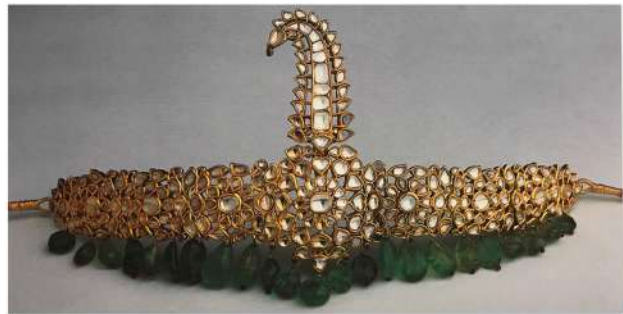
SARPECH (turban ornament) North India; 19th Century Private Collection