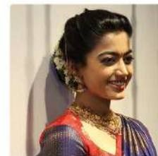
Ms. Rashmika Mandanna