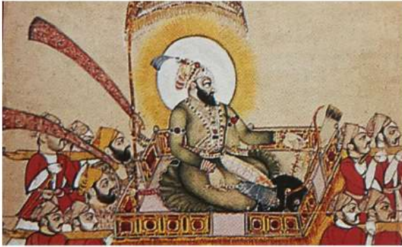
MUGHAL EMPEROR FARRUKH SIYAR IN PALANQUIN. Rajasthan, Kotah; 1720

The kalgi (Persian: jigha-crest; Hindi: sarpech), a turban ornament, was worn exclusively by the emperor, his family and entourage. It was the ultimate symbol of royalty, or royal favour, similar to the European orders; presentation of a kalgi indicated imperial approval. The Institutes of Timur states that besides the customary belt, sword and horse, a warrior who distinguished himself was to be rewarded with a jewelled heron's feather. Shaped like a plume, the kalgi was a jewelled brooch with large pearl or gemstone usually dangling from its curved tip. This elaborate creation evolved from the earlier Mughal practice of pinning a heron's feather (kalgi) to the front of the turban. Attaching a pearl to the end of this plume so that it curved backwards in a graceful arc was de rigueur in Jahangir's reign. A style introduced by the emperor himself, it is a visible feature in most miniature portraits of him.