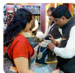
KALASHA @ JITO EXHIBITION