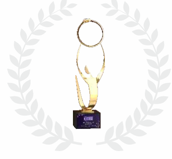
Temple Jewellery Of The Year IJ Jewellers Choice Design Awards 2018

Visit Kalasha For Exclusive Jewellery In Diamond | Jadau | Gold | Platinum | Silver Banjara Hills, Hyderabad | MG Road, Vijayawada | Jayanagar, Bengaluru