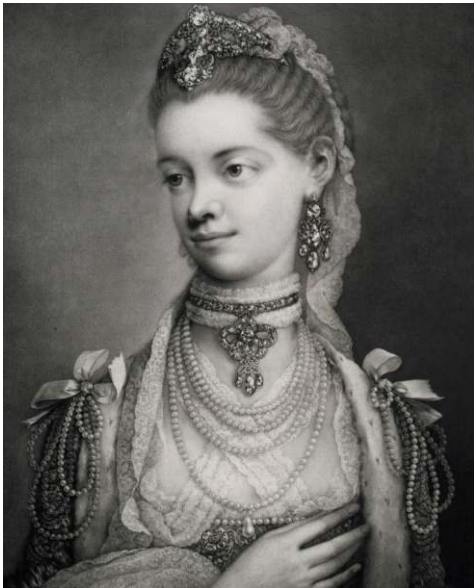
Charlotte of Mecklenburg-Strelitz

The Victorian era is without a doubt, the most influenced, and influential eras of antique and estate jewelry. As with most estate jewelry, the era is defined by the British monarch, in this case, Alexandrina Victoria, Queen of the United Kingdom of Great Britain and Ireland, as well as the Empress of India, years 1837-1901. There are 3 time periods within this era. First, the early, Romanitic period, which is soaked in traditions, natural motifs in gold and silver, clear stones only being worn during the day and colored gems by night.