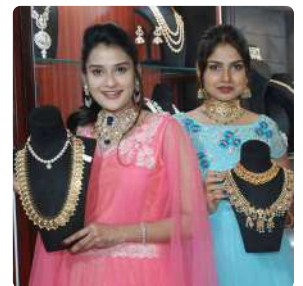
Royal Heritage Nizami Collection launch @ Nizamabad Exhibition