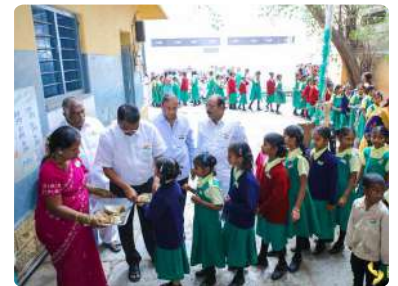
Republic Day 2019 Celebrations @ Andhra Saraswati Balika Patashala