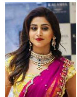
Varshini Sounderajan (Actress)