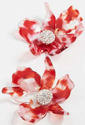
SMALL CRYSTAL LILLY STUDS

Try these bright red guys with sparkly accents embedded in them.