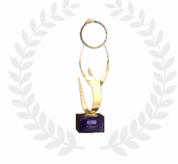
Temple Jewellery Of The Year IJ Jewellers Choice Design Awards 2018

Visit Kalasha For Exclusive Jewellery In Diamond | Jadau | Gold | Platinum | Silver Banjara Hills, Hyderabad | MG Road, Vijayawada | Jayanagar, Bengaluru