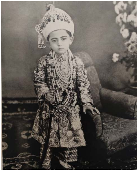
Sahebzada Salamat Jah in Royal Regalia

The Nizam and the princes would wear ceremonial regalia to attend official function. In addition to the sarpech, a turra of gold wire, a distinguished ornament worn only by members of the royal household used to be worn. Princes often wore a smaller sarpech, the turra as well as necklaces, armbands and belts. Only high-ranking officials would wear the turban ornaments. The crown jewels constituted exquisite pieces and large gemstones as head ornaments for the head-dress an important component of dressing of the princes. Some of the exquisite pieces and large gemstones were used as head ornaments. The sarpech signified power and hierarchy.