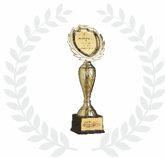
The Best Heritage Bridal Jewellery - Times Retail Icons 2018 -