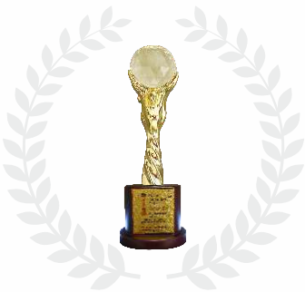
Store Of The Year 2017 By UBM

Gold jewelry differs around the world as tastes and preferences differ but south Asian gold jewelry is generally more pure than jewelry made in western countries. Jewelry in south Asia is generally 22 karat where western jewelry is closer to 14 karat. Color of Gold can be modified depending on the other metals it's alloyed with.