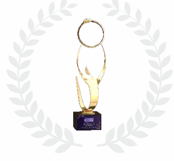
Temple Jewellery Of The Year IJ Jewellers Choice Design Awards 2018

Visit Kalasha For Exclusive Jewellery In Diamond | Jadau | Gold | Platinum | Silver Banjara Hills, Hyderabad | MG Road, Vijayawada | Jayanagar, Bengaluru