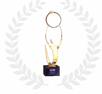
Temple Jewellery Of The Year IJ Jewellers Choice Design Awards 2018

Visit Kalasha For Exclusive Jewellery In Diamond | Jadau | Gold | Platinum | Silver Banjara Hills, Hyderabad | MG Road, Vijayawada | Jayanagar, Bengaluru