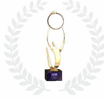
Temple Jewellery Of The Year IJ Jewellers Choice Design Awards 2018