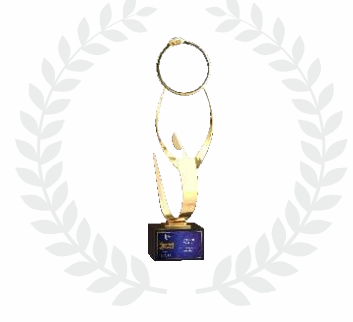
The Best Ring Design Award 2020

Visit Kalasha For Exclusive Jewellery In Diamond | Jadau | Gold | Platinum | Silver Banjara Hills, Hyderabad | MG Road, Vijayawada | Jayanagar, Bengaluru